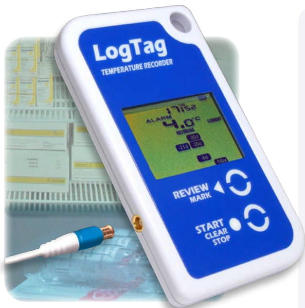
Part codes TRED30-7R, TRED30-7F

The LogTag® TRED30-7 Temperature Recorder measures and stores up to 7770 temperature readings over -40°C to +99°C (-40°F to +210°F) measurement range from a remote temperature probe.